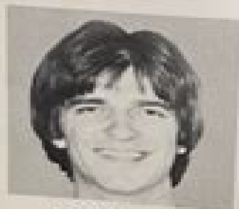
PETE MARAVICH New Orleans Jaxx