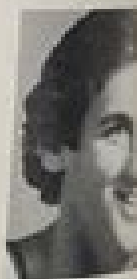
PAUL WESTPHAL Phoenix Suns