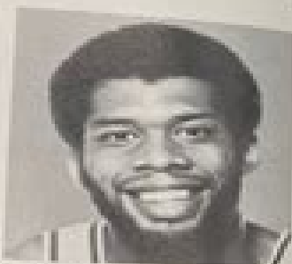
KAREEM ABDUL-JABBAR Los Angeles Lakers