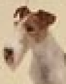
West Highland White Terrier

The Border Terrier is a breed of dog that is known for its scruffy coat and powerful build. They are often used for guarding and hunting.