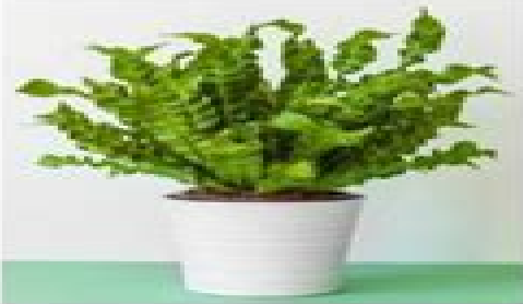
Bird's Nest Fern