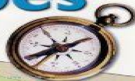
Directions Students in Room 9 Travel to Get Home From School