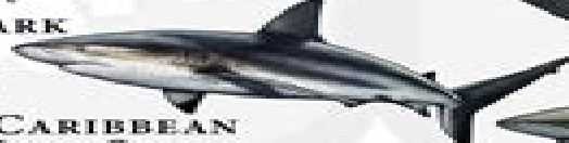
SALMON SHARK Lamna ditropis