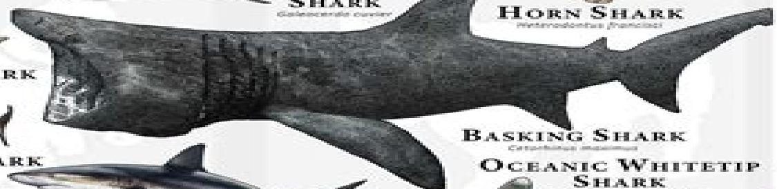
BASKING SHARK Cetorhinus maximus