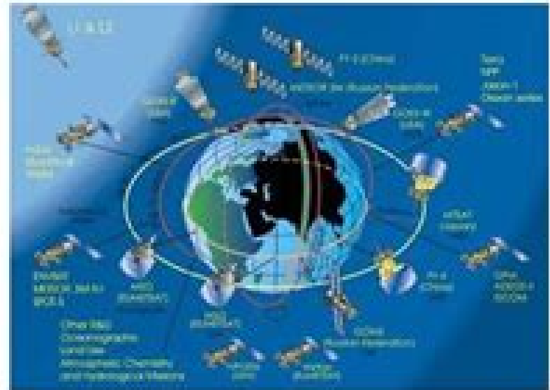
Coordinated Satellite Activities