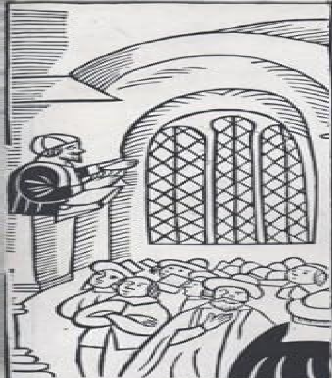
The Orthodox true Minister,