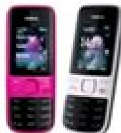
Entry Mobile Phones