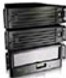
Other Cache Memory