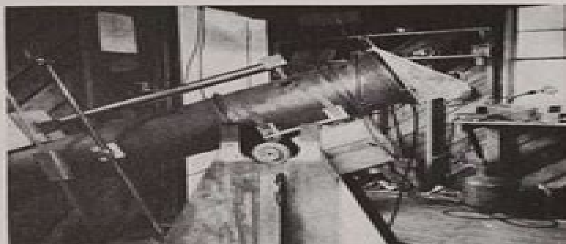
FIGURE 1. Telescope and spectrometer for measurements of atmospheric attenuation of infrared radiation.

twin-T amplifier of about 0.5 c pass-band width. The a-c voltage of this amplifier is rectified by an electronic component which functions in such a manner that its d-c output voltage is very nearly pro-