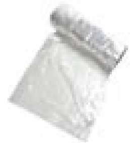
Dry cleaning bags