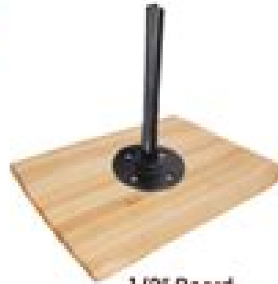
1/2" Board 1/2" flange & pipe