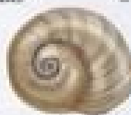
Shark Eye (E)

Tegula funiculata To 1 in. (2 cm) Rounded, black shell with a smooth apex.