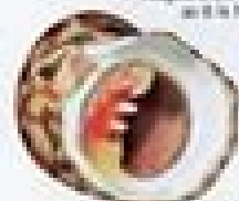
Bleeding Tooth (CB)

Hydrobia ulitiformis To 1 in. (2 cm) Brown to white shell has body seal frills and spines. Species found in aquatic waters have smoother shells. Found in intertidal waters.