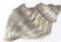
Frilled Dogwhelk (W)

Collusio sp. To 1 in. (2 cm) high Pearl-like, strongly ridged shell is as wide as it is high.