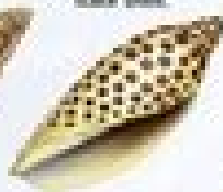
Johnston's Nassa (CB, CB)

Nassarius lineatus To 1 in. (2 cm) high Whitish shell has 4-6 beaded spiral ridges. Southern specimens often have 3 spiraling red brown lines.