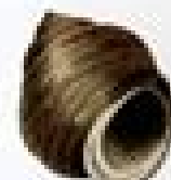
Common Periwinkle (B,V)

Euryspira angulata To 1 in. (2 cm) high Shell has 4-10 ribs, blade-like ribs.