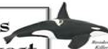
Residual Killer Whale