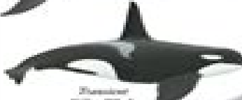
Dusky Killer Whale