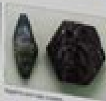
Various colored corundum gemstones