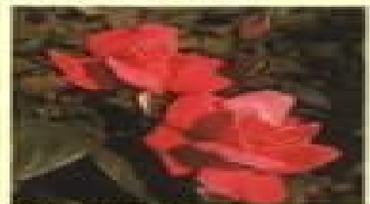
Large red flowers - Geranium