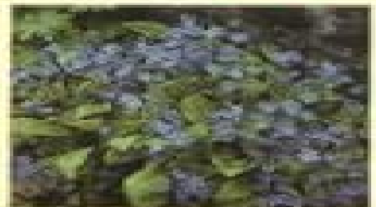
Small blue flowers - Geranium