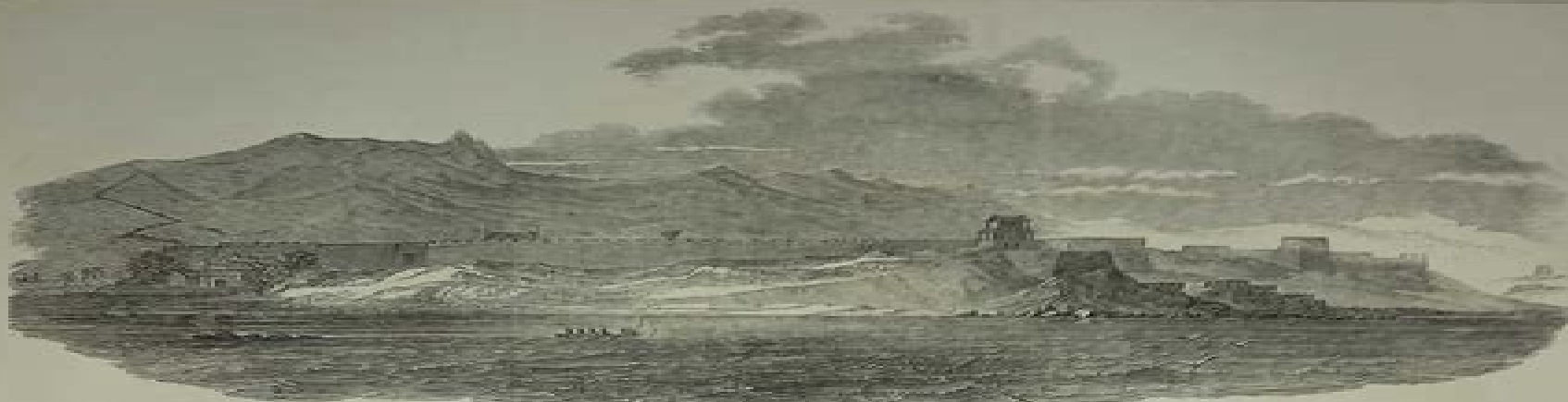
GENERAL VIEW OF THE GREAT WALL OF CHINA, FROM THE WALL.

Towers placed in succession at short intervals, and were seen to the East, and West, the whole being almost perfectly level. The surrounding country was very fertile, and the soil was rich. The wall was built of brick, and the stones were laid in the mortar. There are several gates in the wall, and the wall is very high.