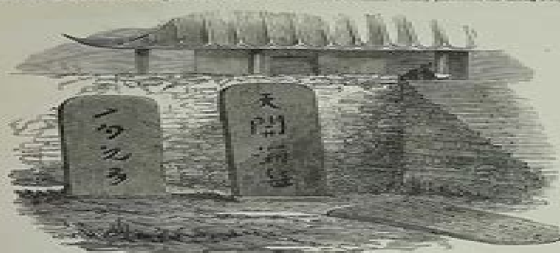
GATEWAY OF THE GREAT WALL OF CHINA.

There is a large gate in the wall, and the wall is very high. The wall was built by the Chinese, and was used for many years. It was built of brick, and the stones were laid in the mortar. There are several gates in the wall, and the wall is very high.