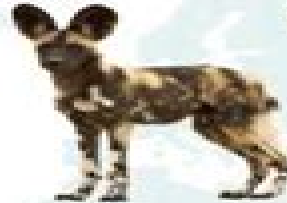
African Wild Dog