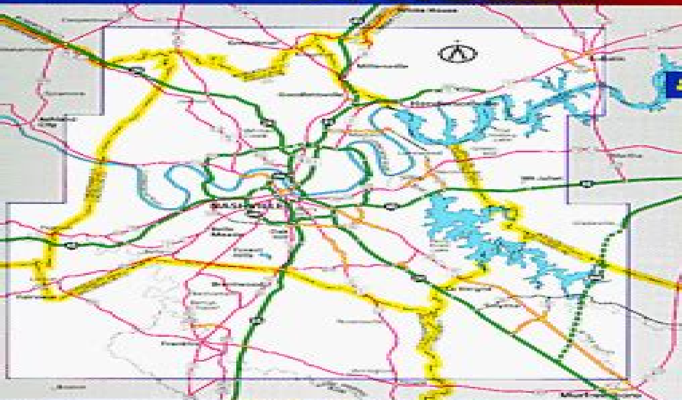
StreetFinder Coverage Area