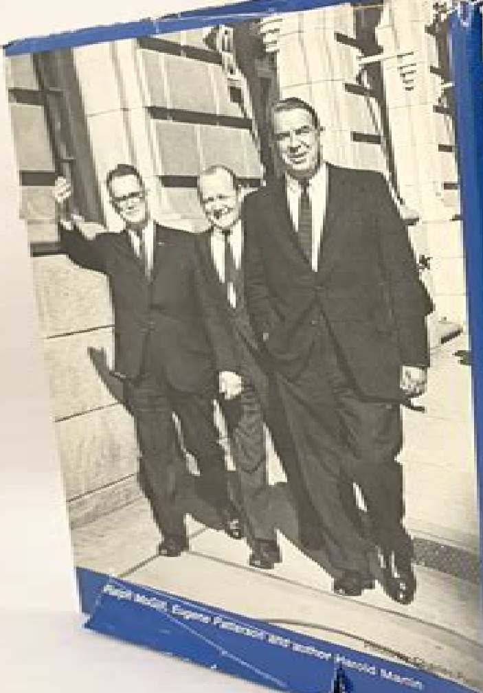
Ralph McGill, Eugene Patterson and author Harold Martin