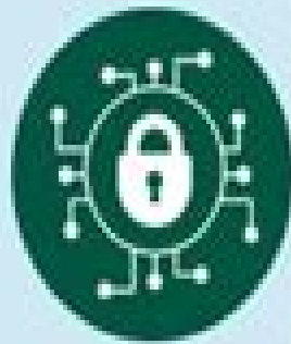
Cyber Security Experts