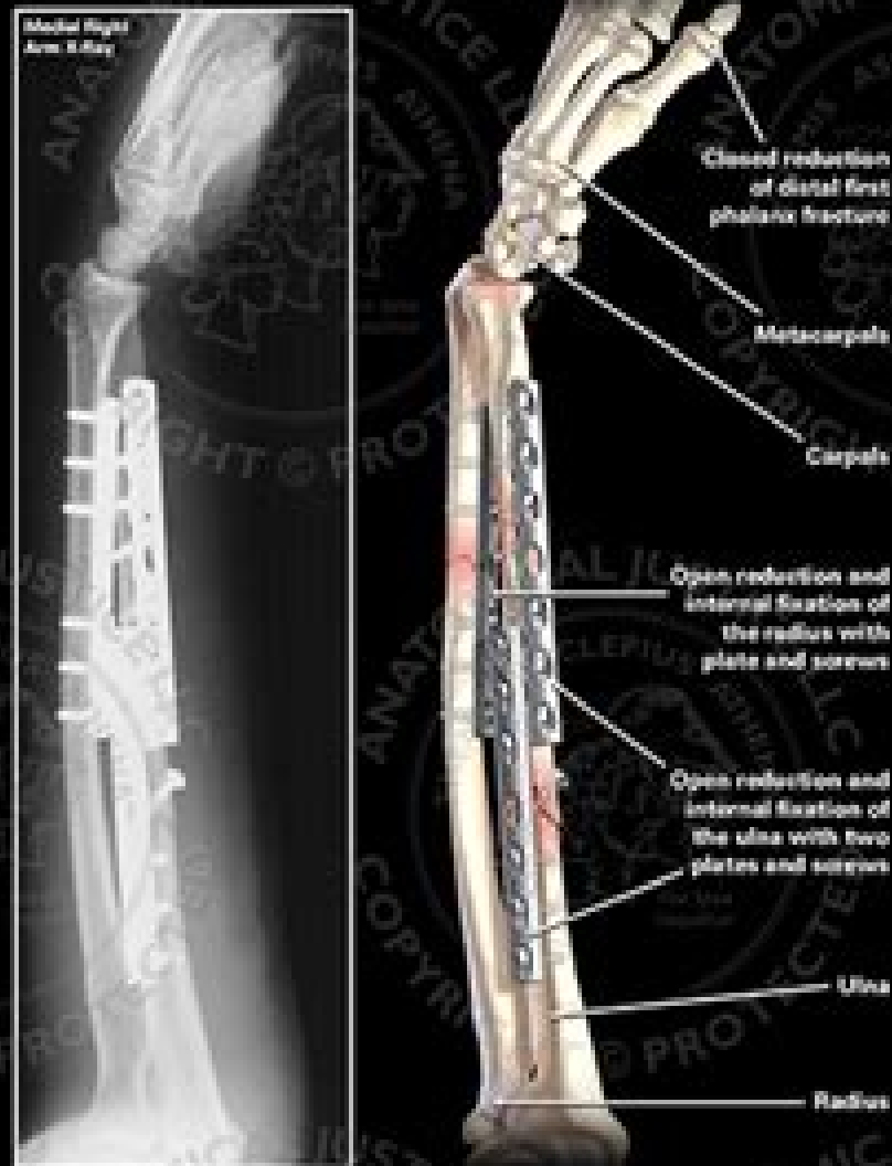
Medial View of the Right Arm