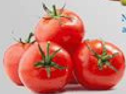
Tomato - Provides vital nutrients such as iron & Vitamin C & E