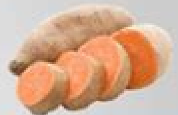
Sweet Potatoes - lower GI potatoes alternative