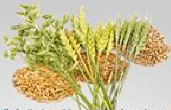
Whole Grains - Magnesium, chromium, omega 3 fatty acids, folate, fiber and potassium.