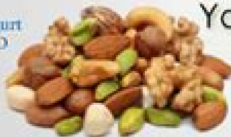
Nuts - Healthy fats & appetite suppressant