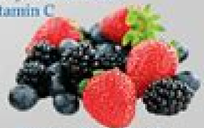
Berries - Packed with antioxidants, vitamins and fiber