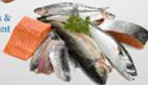
Fish such as Salmon, high in Omega-3