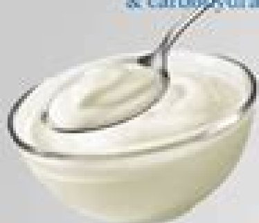
Fat-free Milk and Yogurt Calcium & vitamin D