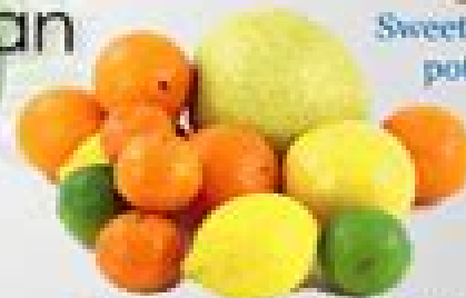
Citrus - Your daily soluble fiber and vitamin C