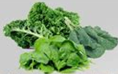
Dark Green Vegetables - Low in calories & carbohydrate