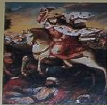
Warrior on Horseback, 1980, W. C. A. S. - 1980