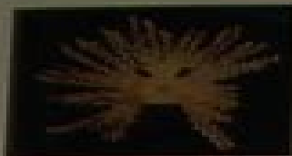
Sunburst, 1980, D. C. A. S. - 1980