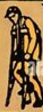
Man fit for Service