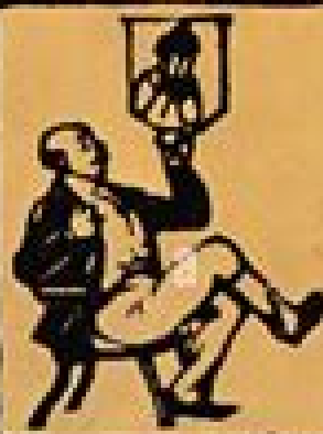
Proprietor of white Slaves