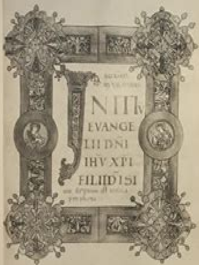
INCIPIT EVANGELIUM SECUNDUM IESUM CHRISTUM SECUNDUM MATTHEUM