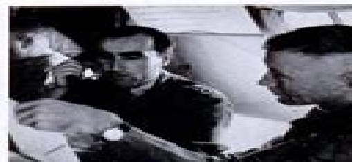
ALLIED COOPERATION is practiced at a Deep Water field headquarters by a U.S. Marine Corps major (right) and a Turkish army artillery major.

In two days of mock warfare, the U.S. Sixth Fleet landed 8,000 U.S. Marines along the Dardanelles by helicopter and landing craft. The Marines joined up inland with 21,000 troops of the Turkish army to form a firm defensive wedge backed up by atomic weapons, anti-aircraft missiles, antitank guns and the fleet's carrier-based jet fighters and jet interceptors.