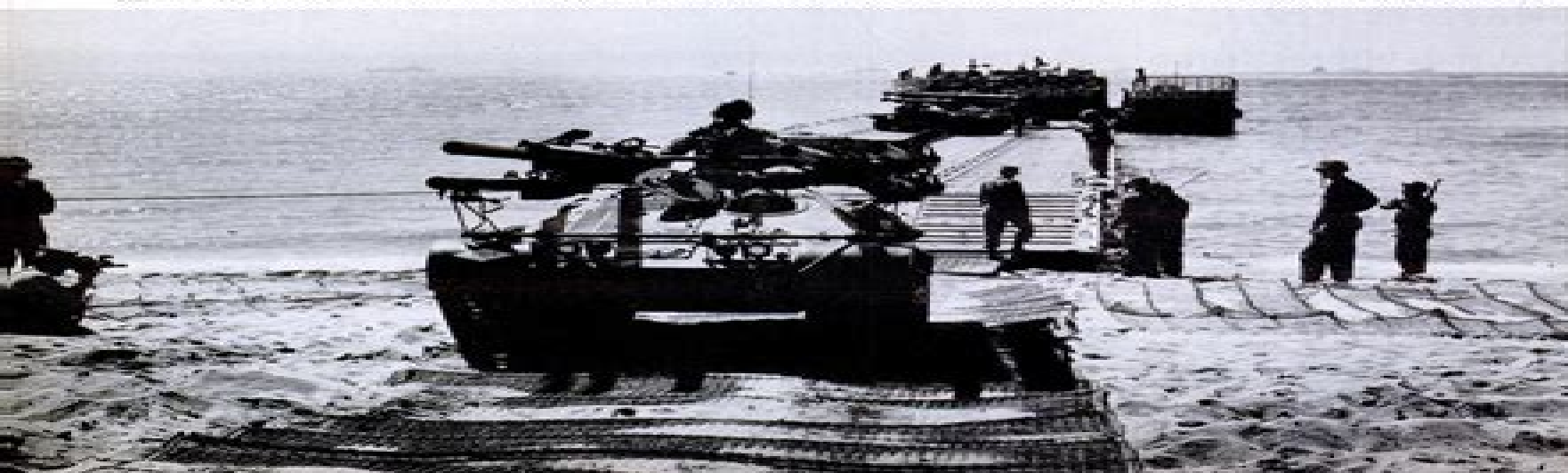
U.S. MARINES LAND ON GALLIPOLI WITH AN ONTOS, A NEW ANTITANK WEAPON WHICH CONSISTS OF ARMORED VEHICLE BRISTLING WITH SIX RECOILLESS RIFLES