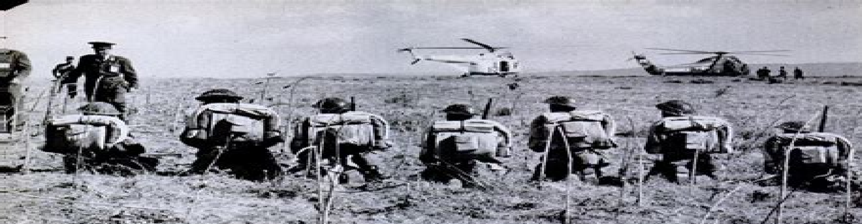
TURKISH SOLDIERS, READY TO BE FLOWN INTO MANEUVER AREA BY U.S. MARINE HELICOPTERS, WAIT FOR THEIR ORDERS TO LOAD UP IN THE AIRCRAFT