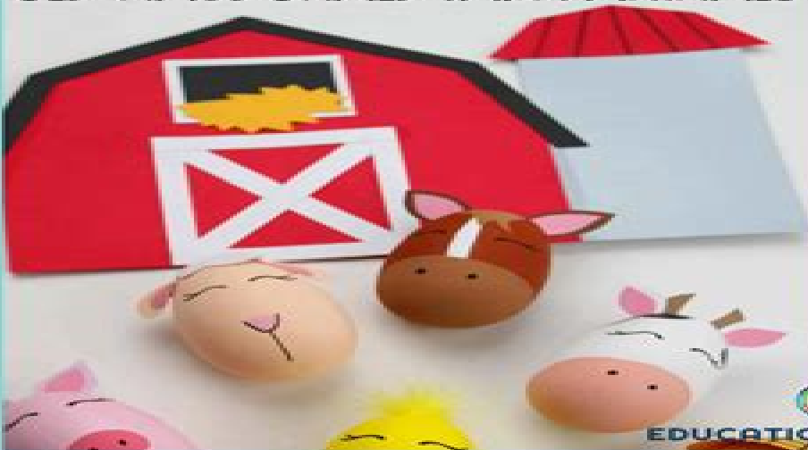
OLD MACDONALD FARM ANIMALS