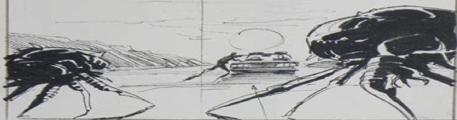
④ Contre jour sur la voiture et au 1 er plan : 2 RUNNERS + petit.