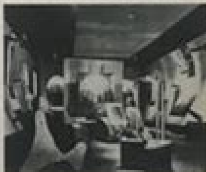
Interior design for the United States Capitol, 1925. The photograph shows the interior of the United States Capitol, 1925.