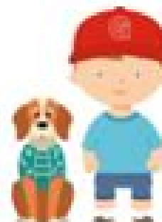
Polly Punctuation & Grammar Gabe