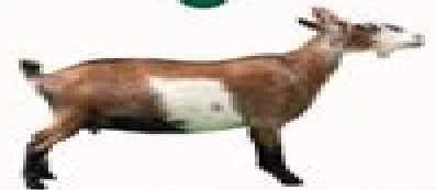
Nigerian Dwarf Goat