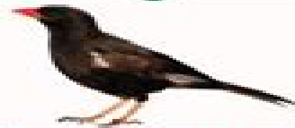
Red-billed Buffalo Weaver