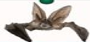
Kitti's Hog-Nosed Bat