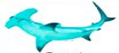
Great Hammerhead shark