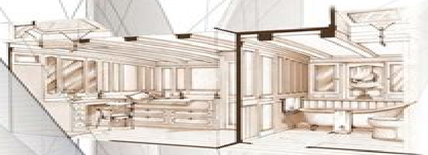
▲ King's Cabin