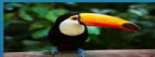
3. TOCO TOUCAN