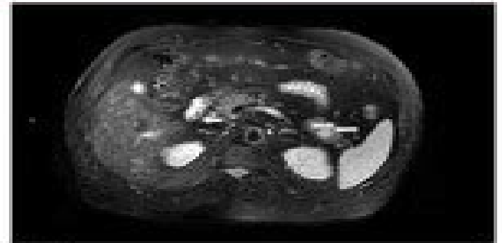
Figure 2 T2 MRI image of abdomen