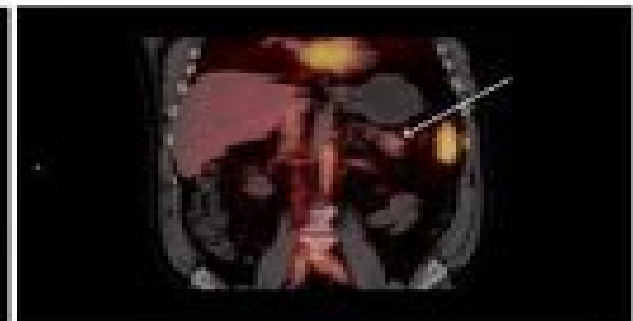
Figure 4 SPECT/CT axial abdomen image