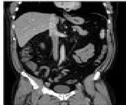
Figure 1 CT coronal image of abdomen

SPECT/CT images of the abdomen demonstrate focal tracer activity, approximately 1.7 cm in the pancreatic tail, corresponding to the finding noted on the recent MRI scan. This SPECT/CT finding is consistent with a splenule in the pancreatic tail.