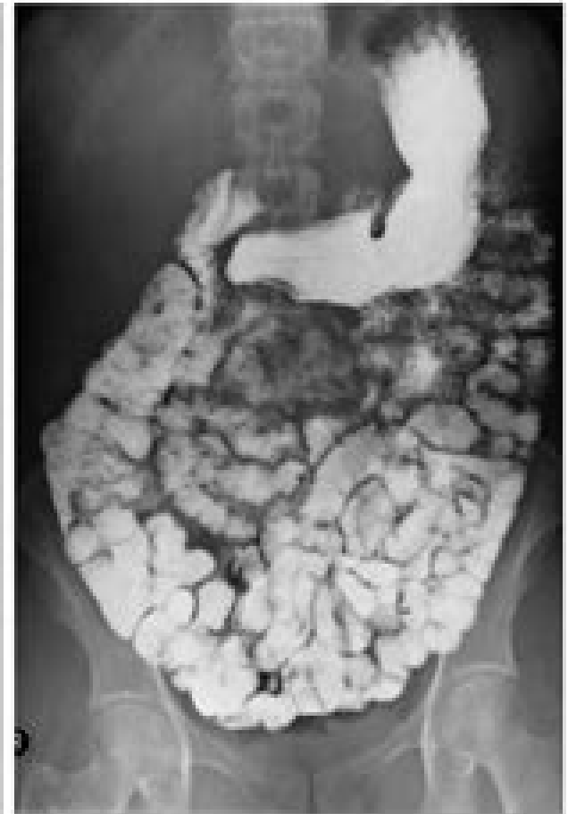
Barium showing the stomach and the small intestine