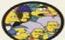
AND A CAST OF THOUSANDS!