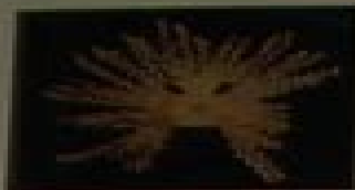
Sunburst, 1989, D. C. A. A. A. A. A.