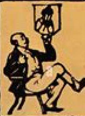
Proprietor of white Slaves