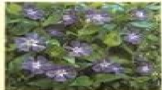
Masses of small flowers: 'Gypsy Pink' geranium