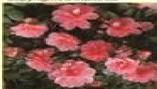
Double red rose garden - Rose