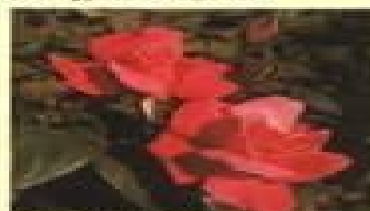
Small red flowers - Garden