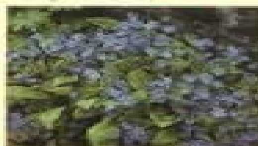
Small blue flowers - Garden