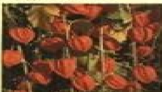
Small red flowers - Garden