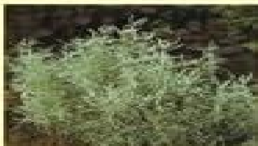
Large green plant - Garden