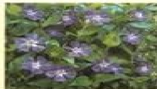
Small light purple flowers - Geranium