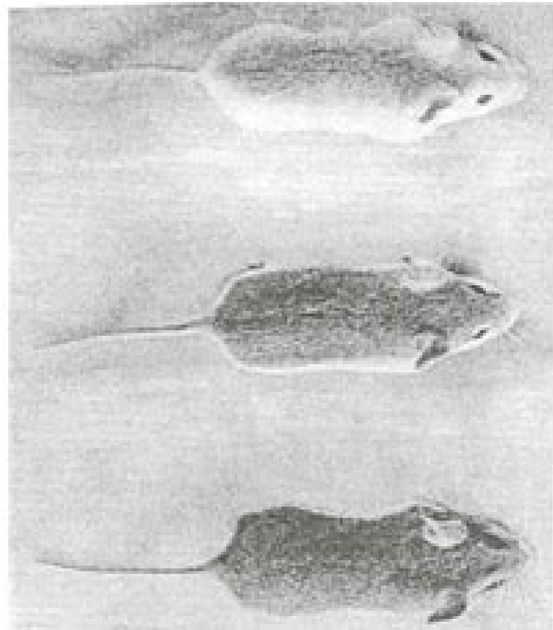
Light color is favored on sandy soil