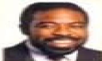
Les Brown Motivational Speaker, Author of 101 Thoughts to Drive You