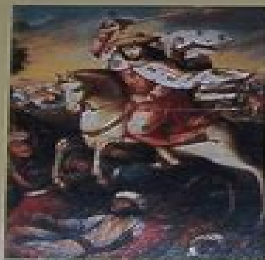
St. George and the Dragon, 1989, J. M. W. Turner - 1989