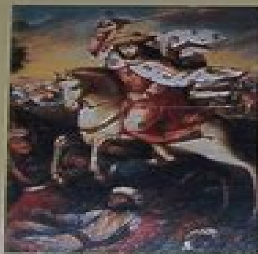
Chivalry, 1989, M. C. Escher