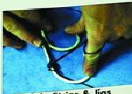
Plain Strips & Jigs