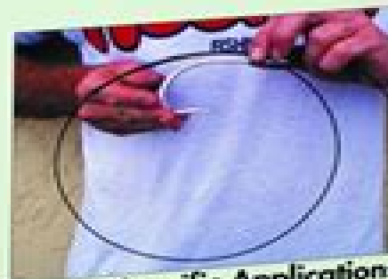
Species Specific Applications

Learn How to Rig Balleyhoo, Mullet & Mackerel to Catch Big Game Fish