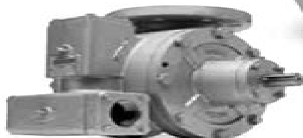
Model Z4200 Truck Pump