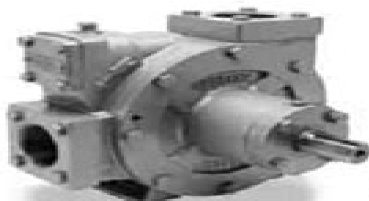
Model Z2000 Truck Pump