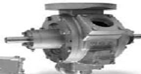
Model Z3200 Truck Pump