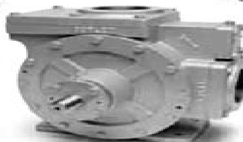
Model Z3500 Truck and Stationary Pump