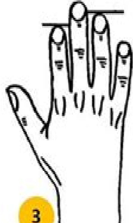
Longer Ring Finger Shorter Index Finger