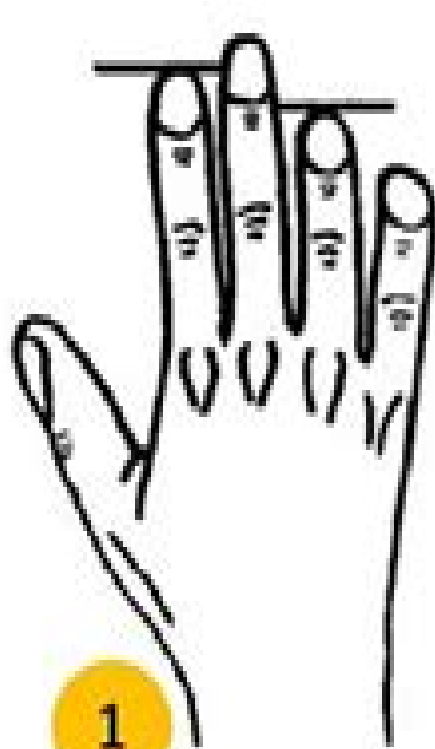
Longer Index Finger Shorter Ring Finger