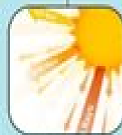
UV Rays Exposure