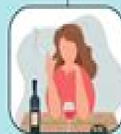
Smoking & Drinking