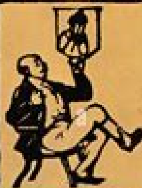
Proprietor of white Slaves