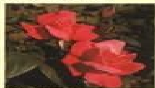
Large red flowers - Geranium