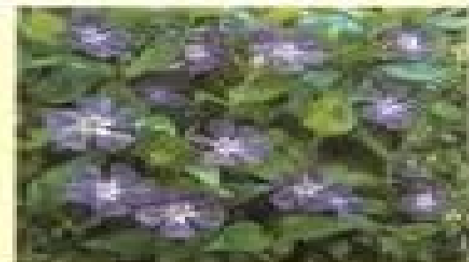
Small purple flowers - Geranium