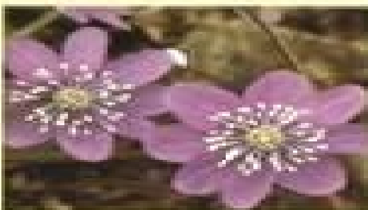
Large purple flowers - Geranium