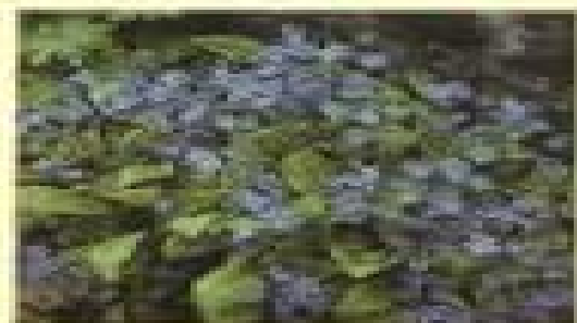
Small blue flowers - Geranium